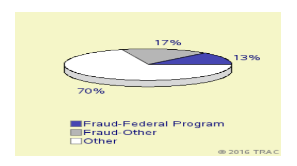
Figure 2 tells about the convictions by investigation agency-:

Figure 1 shows about the specific convictions-: